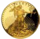
One (1) 1oz. Gold Coin Courtesy of Argen Corporation